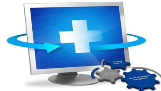
Critical Care for Technology