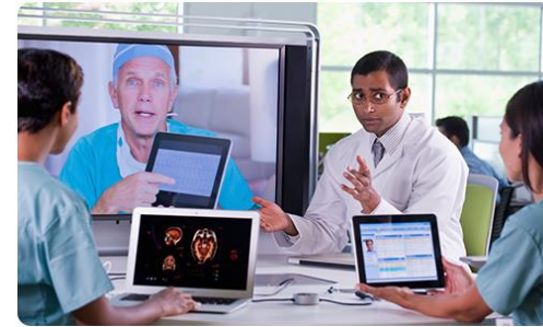
Collaboration & Telehealth

Meaningful Use PCI HIPAA HITECH Breach Notification Red Flag Rule