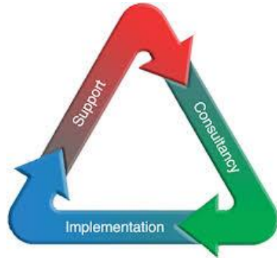
Technology Deployment & Integration